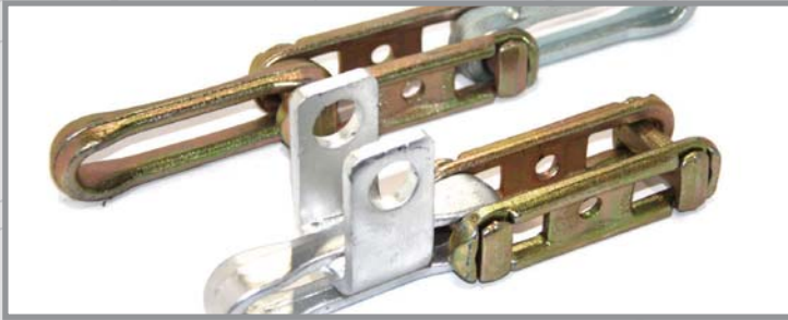
- Carrier link for X458 chain